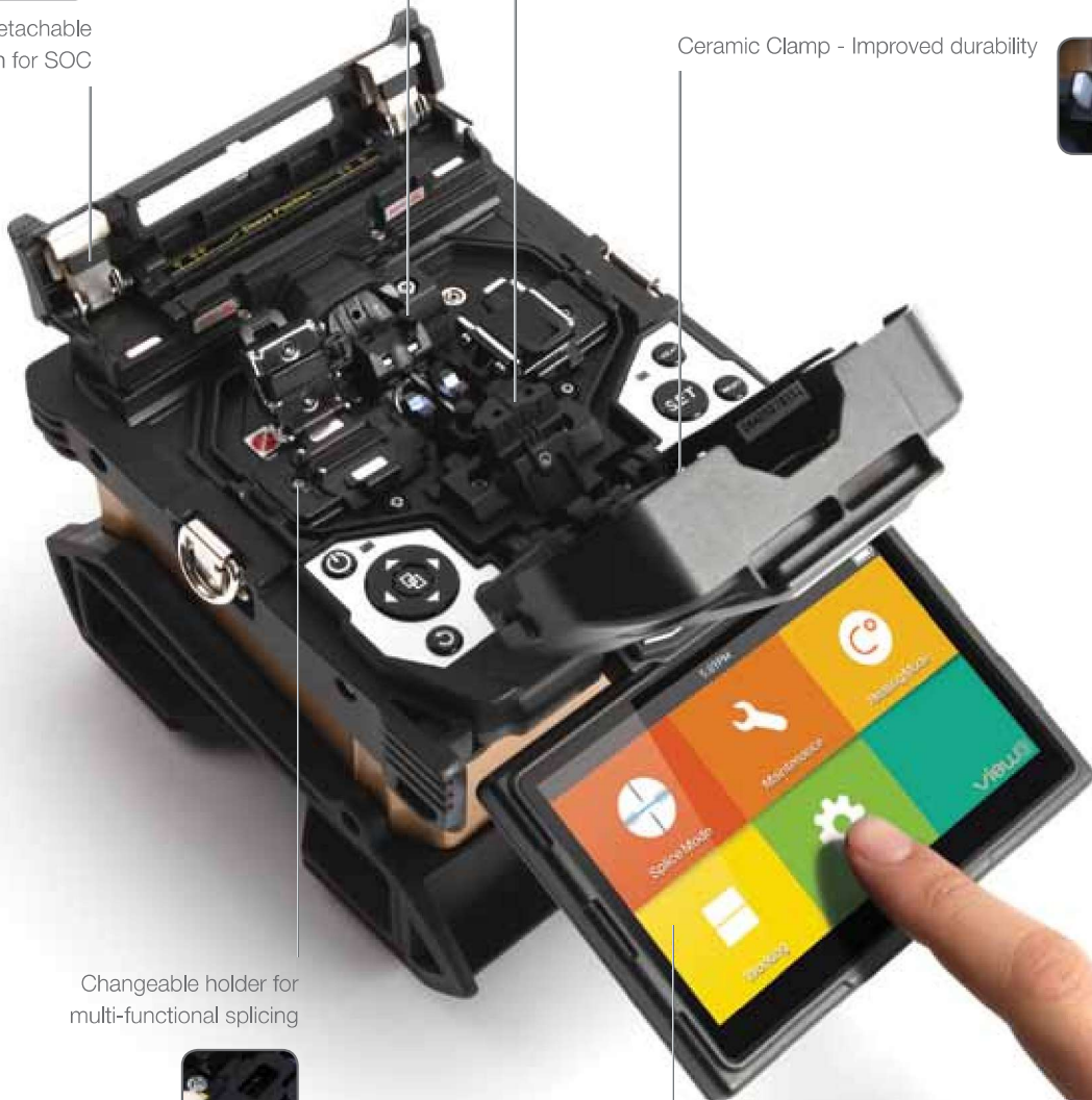
Changeable holder for multi-functional splicing